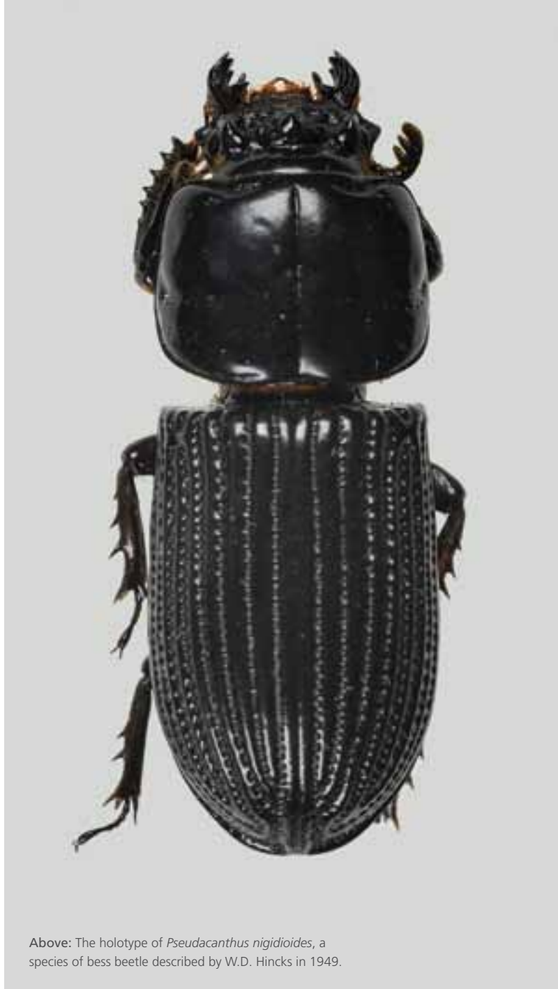
Above: The holotype of Pseudacanthus nigridioides , a species of bess beetle described by W.D. Hincks in 1949.

The scientific quality and international reputation of any natural history collection is measured by the number of deposited type specimens. A 'type specimen' (or 'type') is a reference specimen selected by a scientist during the description of a new species. Type specimens serve as the primary and unique references for all known species names. They play a key role in stabilizing the use of species names. The Entomology Department holds more than 12,000 type specimens representing some 2,500 species names of primarily foreign insects. This makes the Manchester Museum one of the most important entomological depositories in the UK.