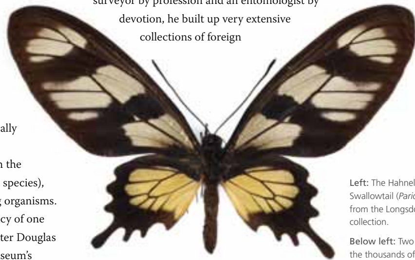
Left: The Hahnel’s Amazonian Swallowtail ( Parides hahneli ) from the Longsdon butterfly collection.