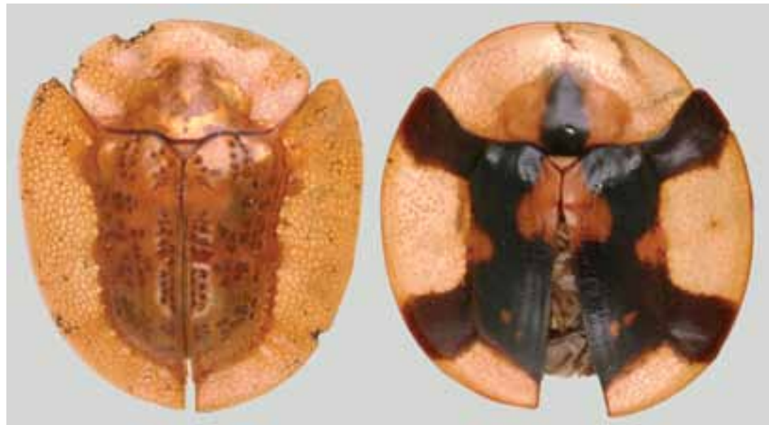
Below left: Two of the thousands of type specimens of the Manchester Museum’s collection of tortoise beetles (Cassidinae), Meroscalsis dohertyi (left) and Lorentzocassis papuana (right).