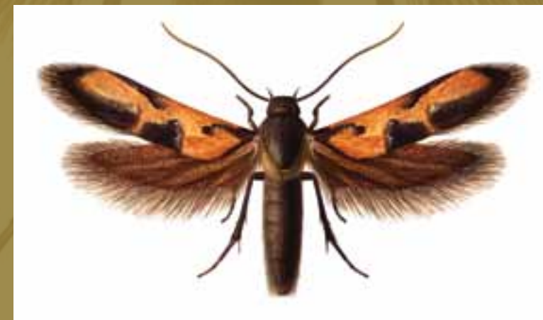
Above: A reconstruction of the Manchester Moth.

The most famous specimen in the Entomology collection is the celebrated Manchester Moth ( Euclementia woodiella ). It is a tiny, delicate moth, with a wingspan of less than one centimetre. Only three specimens of this moth are available today: in the Melbourne Museum (Australia), in the Natural History Museum (London), and in the Manchester Museum. The Manchester Museum's specimen is badly damaged, with most of its legs, right antenna and half of the abdomen missing, and with the right forewing torn apart. Here we present an accurate reconstruction of the moth. The Manchester Moth remains an unsolved scientific conundrum. Originally, in June 1829, a series of 50/60 specimens was collected by the amateur collector Robert Cribb from Kearsall Moor (Salford, Greater Manchester). He gave one specimen to John Curtis (1791–1862), an eminent authority on insects, who described the moth as a new species in 1830. Two specimens of the moth were also given to the local collector S. Carter. Unfortunately, the storage box containing the rest of specimens of the original series was destroyed by Cribb's landlady in revenge for rent arrears. Since then, nobody else has been able to collect any further specimens, and the moth has not been seen alive. It is believed that this species does not occur outside Britain and is now most likely extinct.