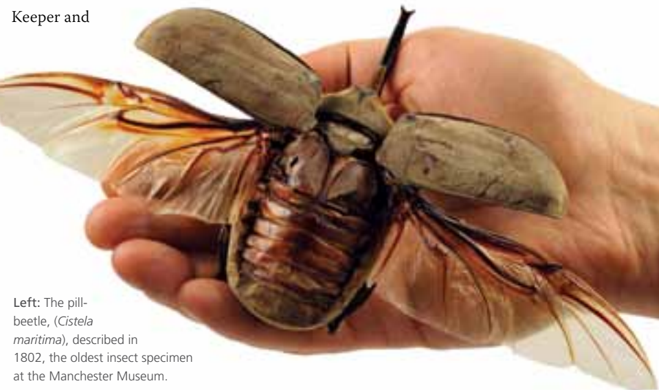
Left: The pill-beetle, ( Cistela maritima ), described in 1802, the oldest insect specimen at the Manchester Museum.