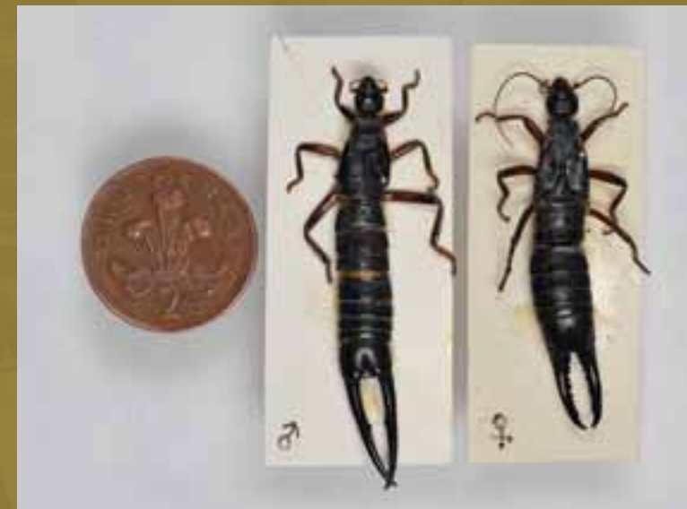
Above: Male and female of the giant earwig.

The Entomology Department retains specimens of a number of extremely rare or already extinct insects. One of them is the magnificent Giant Earwig ( Labidura herculeana ), of which the Museum holds only two specimens, a male and a female. The giant earwig is the world’s largest earwig, and derives from the small volcanic island of St Helena in the South Atlantic. Its body length ranges from 36 to 54 millimetres. The largest known specimen is a male of about 78mm long. The creature is also known as the ‘Dodo of the earwigs’, since it was endemic to a small island and is likely to have become extinct. Fundamental reasons for its disappearance seem to have been the clearing of the Gumwood forest where the species occurred and its predation by introduced animals, particularly by the large centipede ( Scolopendra morsitans ) and mice. Since 1967, when the earwig was still reasonably common, it has not been seen alive, though three unsuccessful expeditions have been organized and sponsored by the London Zoo in order to find and rescue it. However, the earwig has entered into the folklore of St Helena, and many people believe that it is still living out there somewhere.