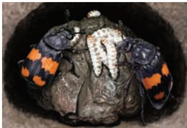
V. A. TIMOKHANOVA

In the northern hemisphere, the dead bodies of small mammals and birds are used primarily by burying beetles, which compete very effectively with carrion-eating mammals. For example, at the Biological Station of Michigan University in the USA, scientists laid 780 fresh bodies of dead house mice on the ground in a hardwood forest. Within 24 hours,