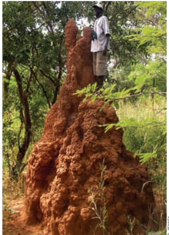
Figure 5 A termite mound in the Gambia (west Africa).

Waldbauer, G. (2003) What good are bugs? Harvard University Press.