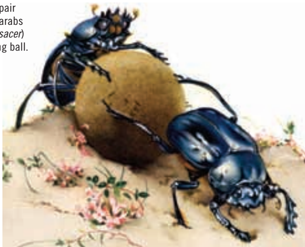
Figure 4 A pair of sacred scarabs ( Scarabeus sacer ) rolling a dung ball.

of waste each year in England and Wales, and about 900 million tonnes in the USA. Dung beetles recycle about a third of this. In the USA alone, the annual economic value of this service is at least $380 million. Unfortunately, the activity of dung beetles is severely disrupted by current agricultural practices, such as the treatment of livestock with drugs to kill parasitic worms. Residues of these drugs persist in the dung and are lethal to the beetles. As a result, the dung pats of treated animals remain biologically undegraded for months, fouling available grazing area. If left unprocessed, livestock wastes may present a health risk to humans, because they can contain pathogenic microorganisms (see Table 2).