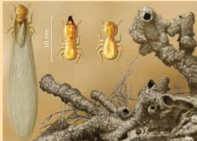
Winged adult (left), soldier with large mouthparts (middle), worker (right), and a section of surface-soil-covered termite runways.

This wood-destroying pest found in Central Asia attacks all kinds of wood, any materials containing cellulose, many stored products, paper, cloth, and some living plants. Even soft plastic materials can be damaged and used by termites for construction of nests.